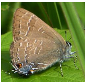
Hickory Hairstreak

The American Snout is a rare immigrant from the South. But on June 16, 40 were reported from Ozaukee Co. On June 17, 5 were reported along the Mississippi River in Grant Co. and, on the 21 st , 6 were reported from Milwaukee Co. The Hackberry Emperor and the American Snout both utilize Hackberry trees which are found in river bottoms. Most sightings are 1 or 2 but the American Snout is this year's 2 nd top invading immigrant and continues to be reported. (One turned up on SWBA's field trip Butterflies of Columbia County. )