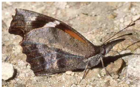
American Snout Not to scale. The Snout is smaller than the Hackberry Emperor.