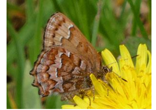
Eastern Pine Elfin

This was the 17 th annual Wazee NABA Spring Butterfly Count, which was conducted in Jackson County at the Bauer-Brockway Barrens and Black River State Forest on May 16, 2023. Such counts are conducted within a 15-mile diameter circle, similar to a Christmas Bird Count. By holding out for the best weather, we had sunny but smoky-white skies (due to smoke from Canadian forest fires) and temperature ranging from 63°F to 79°F. 8 observers in 4-5