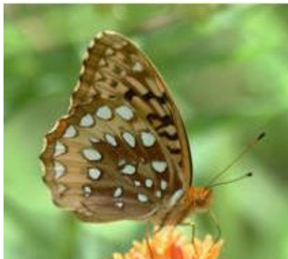
Great Spangled Fritillary

On this morning walk we'll observe and learn about butterflies, those exquisitely beautiful creatures that dance around us in summer. Tod Highsmith and Dreux Watermolen (DNR) will lead this 2 hour walk at Cherokee Marsh on the northeast side of Madison. We will observe a variety of butterflies as they take nectar from wildflowers, and learn about their identification, behavior, and lifestyle. Bring binoculars if you have them — close-focusing ones work best. We have a few extra pairs of binoculars. Wear sturdy shoes, long pants and a hat for protection from the sun.