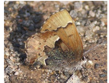
Henry's Elfin is rare.

Ten people turned out for the Jackson County spring butterfly trip. A couple from Texas and a woman from Boston joined us! We found 12 species which is low due to the cold spring. This is the lowest number of species in the 7 years this field trip has been conducted. If we ignore the highly anomalous hot spring of 2012, we have previously averaged 21 species and 232 individuals, but this year we found 12 species and 85 individuals. Nevertheless, we did manage to see all 5 species of Elfins in the state , including the threatened Frosted Elfin. (Elfins fly almost entirely in the month of May). Species encountered are listed below. The best finds are indicated in bold type.