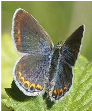
Karner Blue (female)

Meet at 10:00 a.m. at the Sandhill Headquarters parking lot. (The tour will last until 3:00 p.m.) DIRECTIONS: Take I-90/94 up to the New Lisbon area in Juneau Co. and take Hwy 80 north. In