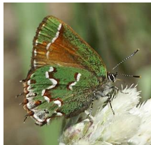
Juniper Hairstreak nectaring on Pussytoes.

Northern bog butterflies showed 8 reports for Freija Fritillary , with high counts of 19 and 21. The Red-disked Alpine garnered 4 reports with highs of 15 and 33! The Mustard White had 5