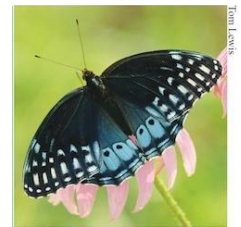
Diana Fritillary (female)

Butterflies include Diana Fritillary, Zebra Swallowtail, Spicebush Swallowtail, Lace-winged Roadside Skipper and possible Hickory Hairstreak, etc.