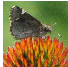
Common Roadside Skipper. Note the checkered fringe, the oversize white chevron on the forewing, and the frosting on the hindwing.