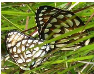
Regal Fritillaries mating.

A large group of 33 people enjoyed the tour of Shea Prairie, owned by The Prairie Enthusiasts. The hill was a paradise for Fritillaries! We had a good view of the endangered Regal Fritillary , which is one of Wisconsin's most beautiful butterflies . (They have dissappeared from much of their original range in eastern U.S.)