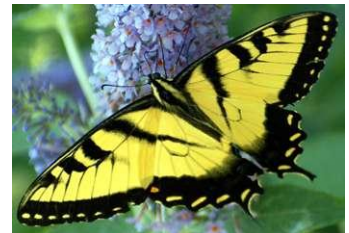
Eastern Tiger Swallowtail