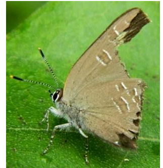
This Hickory Hairstreak was still able to fly!