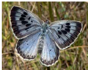
Large Blue is globally endangered.

A butterfly collector who illegally captured and killed specimens of Britain's rarest endangered butterfly, the Large Blue, has been apprehended and sentenced. The Large Blue is globally endangered and has a remarkable life cycle. Eggs are laid on flower buds. The caterpillars burrow into the flower heads and eventually drop to the ground where a single species of ants are attracted to secretions from the caterpillar. The ants then put the caterpillars into their brood chamber and the caterpillars feed on ant larva. The butterflies emerge in the middle of summer. Because of this exceptional life cycle the butterflies cannot be bred in captivity . As a result, illegally obtained dead Large Blues can sell for up to $390 each. A butterfly collector was spotted as he climbed over locked gates and used a small net to