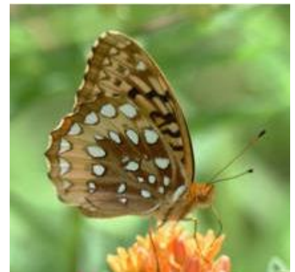
Great Spangled Fritillary