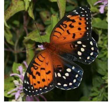
The female Regal Fritillary has two rows of spots ( both rows white ) on the hind wing.

1) REGAL FRITILLARY photographed at Holy Wisdom Prairie July 23. The Regal Fritillary is an Endangered Species in Wisconsin and one of Wisconsin's most beautiful butterflies! Such isolated appearances of a Regal in prairie areas, that it hasn't been seen in previously, occasionally happens. Typically they emerged at some other site and have wandered. In such cases it is worth noting the gender of the butterfly. Because, IF it were a female, then there is the possibility that she may have