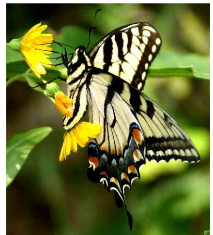
Eastern Tiger Swallowtail

DIRECTIONS: Take Hwy 14 west to Lone Rock, south on Hwy 130 then turn right on Hwy 133. Go west about 5.0 miles, turn right on Hay Road, and drive north to the first parking area.