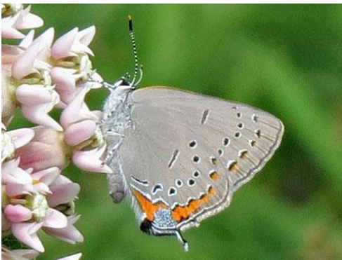
Acadian Hairstreak