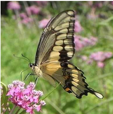
Giant Swallowtail

In good years this can be the best butterfly trip of the