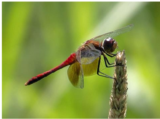
Band-winged Meadowhawk