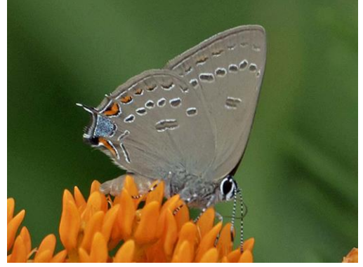
Edwards' Hairstreak