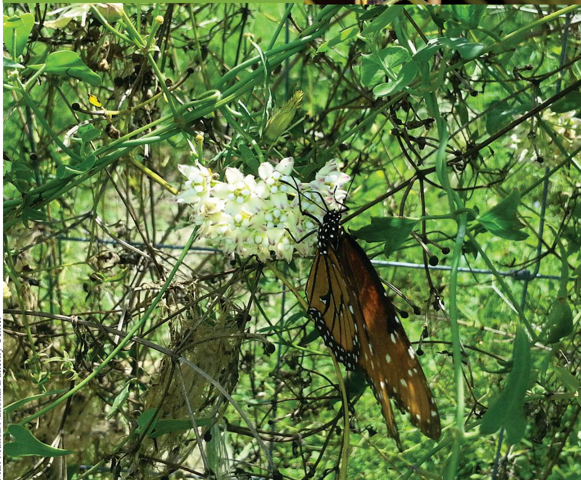
Max Muñoz/National Butterfly Center