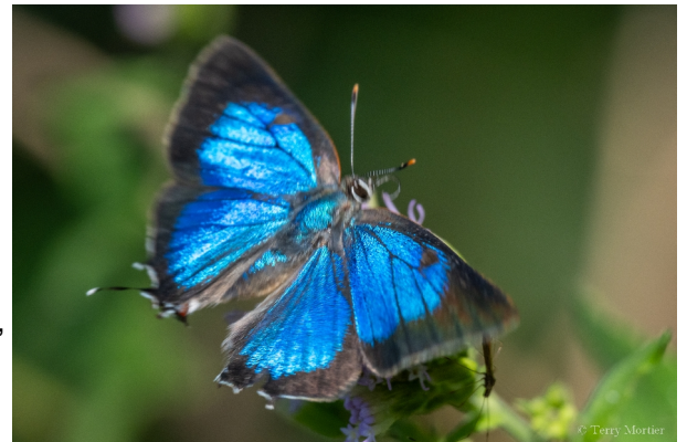
White M Hairstreak